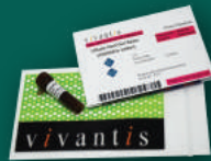
ViSafe Red Gel Stain, 500µl/pack SD0103