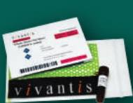
ViSafe Green Gel Stain, 500µl/pack SD0101