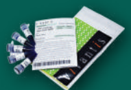
6X Loading Dye, 5x1ml, NM0410

For more information, please visit https://www.rsc.a-star.edu.sg/shop/vivantis or write in to info@bio-etc.com for any queries